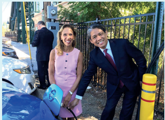
Assemblywoman Paulin joined Gil Quiniones, President and CEO of the New York Power Authority, to announce the installation of the 100th public electric vehicle charging station located at the Metro-North station in Tarrytown.

The 2016-17 State Budget created an incentive and rebate program for Zero Emissions Vehicles (ZEVs) and related infrastructure. The Environmental Protection Fund (EPF) will fund an initiative to provide municipalities with a rebate of up to $250,000 for clean vehicle infrastructure and a rebate of $750 to $5,000 for each eligible ZEV purchased by the municipality, based on the vehicle's range. New York State Energy Research and Development Authority (NYSERDA) will implement a program to provide rebates of up to two thousand dollars to consumers who purchase ZEVs.